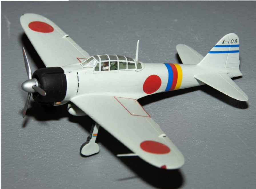
Ron Oro built this 72nd scale Zero from Hasegawa.