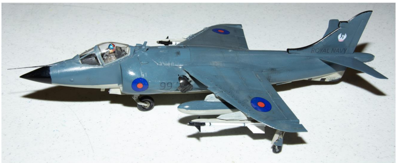
He also built this Harrier from Tamiya. He made decals for both models.