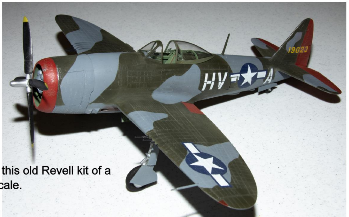
Dave Currier built this old Revell kit of a P-47D in 1/48th scale.